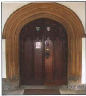
Before and after ...